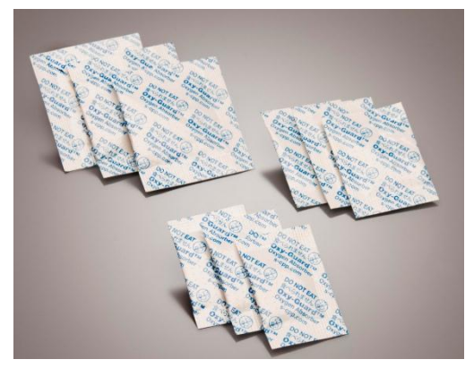
Oxy-Guard packets are available in a variety of sizes to fit your needs

This information corresponds to the present state of our knowledge and is intended as a general description of our products and their possible applications. Clariant makes no warranties, express or implied, as to the information's accuracy, adequacy, sufficiency or freedom from defect and assumes no liability in connection with any use of this information. Any user of this product is responsible for determining the suitability of Clariant's products for its particular application.* Nothing included in this information waives any of Clariant's General Terms and Conditions of Sale, which control unless it agrees otherwise in writing. Any existing intellectual/industrial property rights must be observed. Due to possible changes in our products and applicable national and international regulations and laws, the status of our products could change. Material Safety Data Sheets providing safety precautions, that should be observed when handling or storing Clariant products, are available upon request and are provided in compliance with applicable law. You should obtain and review the applicable Material Safety Data Sheet information before handling any of these products. For additional information, please contact Clariant.